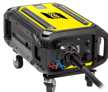
Wheel Kit and Torch Strain Relief works with feeder horizontal or vertical