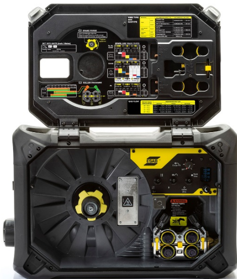
Internal LED lights and integrated storage for wear parts in lid